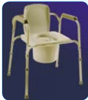
Light 16" wide snap-on seat for added comfort and support.