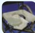
• Padded seat