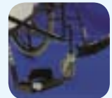
• Footrest with quad release